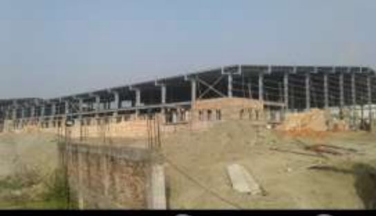
আকিজ প্লাসটিং ওয়ার হাউস বিল্ডিং