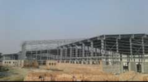
আকিজ প্লাসটিক পাইপ বিল্ডিং