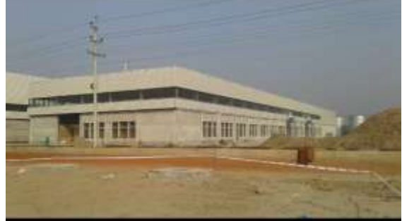
ইমপ্রেগনেশন (আকিজ পার্টিক্যাল)