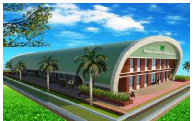
Faculty Building at Bangladesh University of Professionals (BUP)