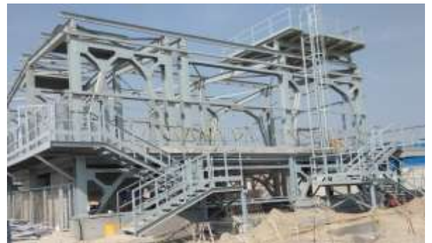
TP6, TP7 & DG4 Lot 5 at Ruppur Nuclear Power Plant (Ishwardi)