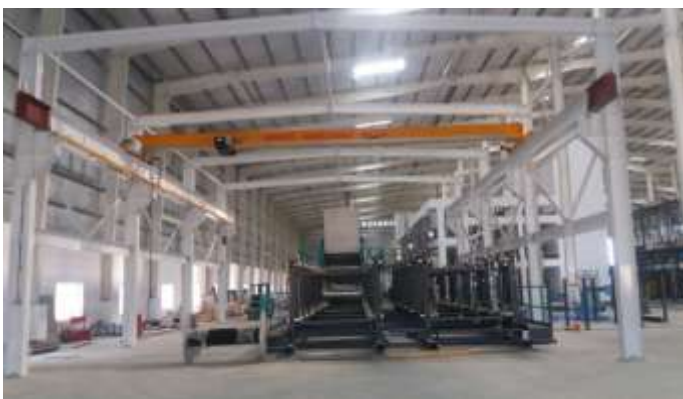
Crane Support Structure for Pioneer Denim Ltd. Hobiganj