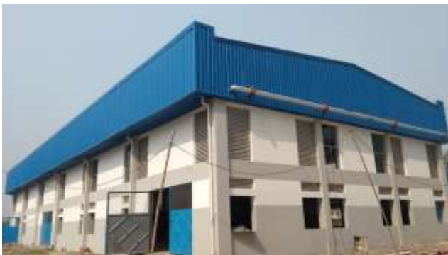
Boiler Building for China Railway Construction Company (CRCC)