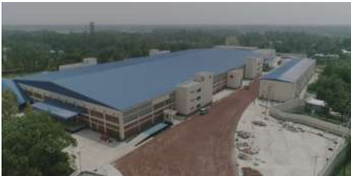
TM Textile & Garments Ltd.