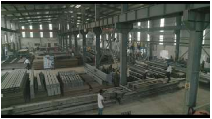
Factory Inside View