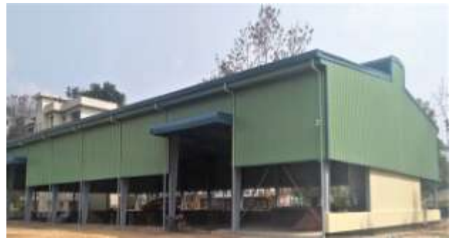
Multipurpose Shed at Jalalabad Cantonment Public School & College