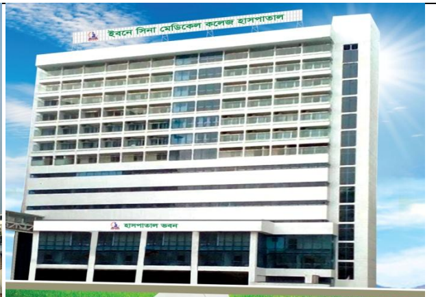
IBN SINA MEDICAL COLLEGE