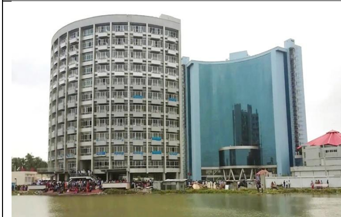
SHEIKH HASINA SOFTWARE TECH. PARK