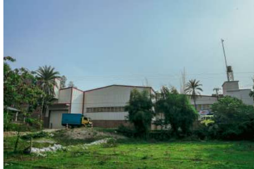
Factory Outside Picture