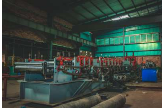
Factory Inside Picture

Four Picture (a) Factory outside & Inside