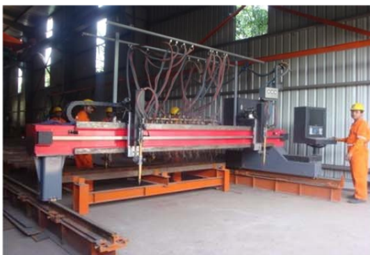
CNC Flame Cutting Machine