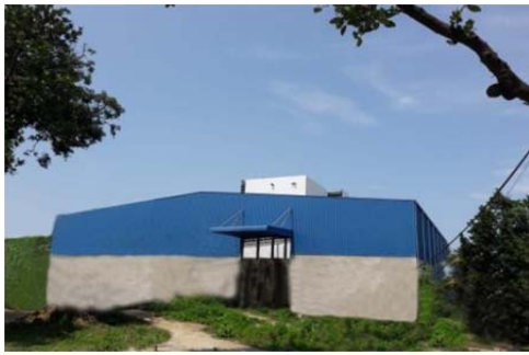
Provita Feed Chittagong