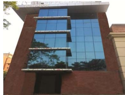
Admin Building, Acme