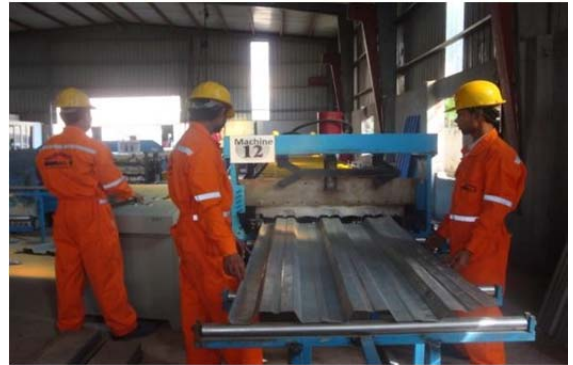
PLC Automatic Deck Profile Machine