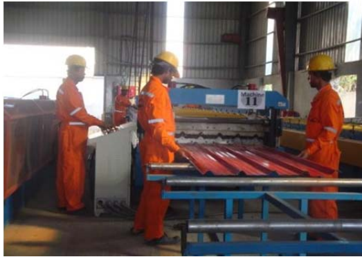
PLC Automatic Roll Forming (Roof & Wall) Machine