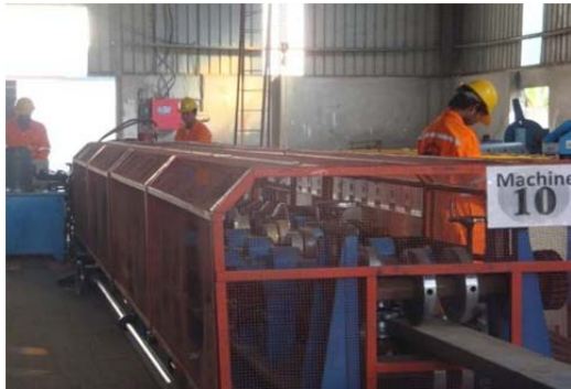
PLC Purlin Machine (C & Z)