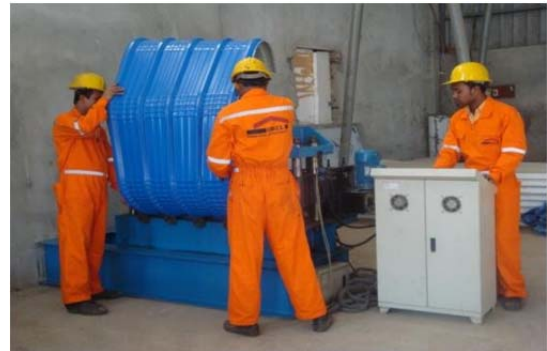
PLC Automatic Curving Machine