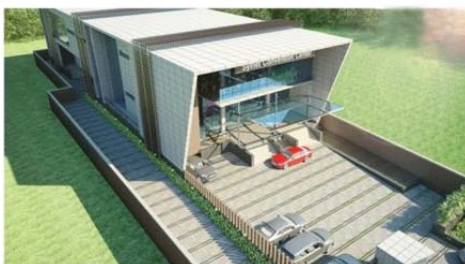
Khan Palace Convention Hall