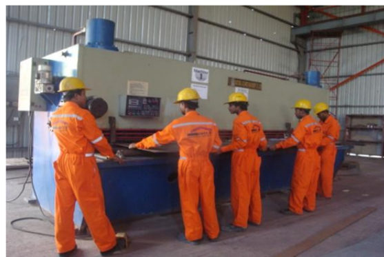
PLC Hydraulic Shearing Machine