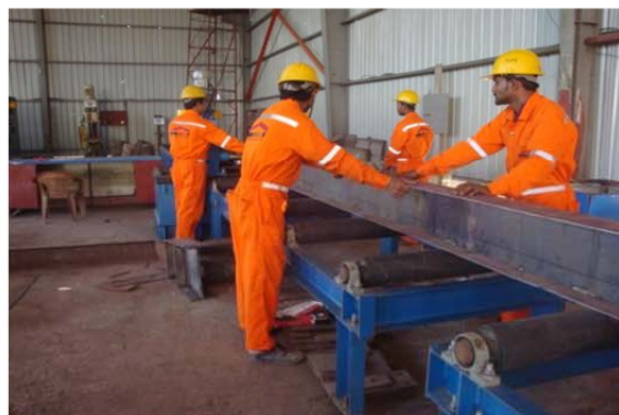
H beam Automatic assembly Machine