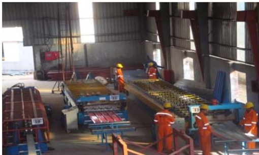
PLC Automatic Production Line (Profile)